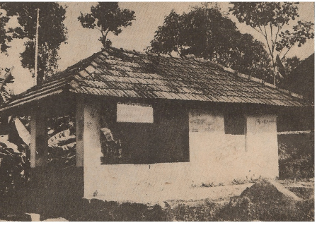
Cheriyamma Smaraka Vayanasala at Nedungom Village, Kannur