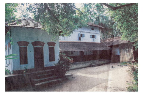
Nayanar Balika Sadanam at Eranjipalam, Kozhikode